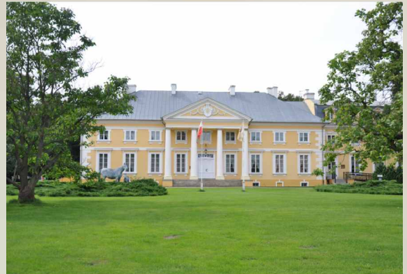
Palace in Racot.