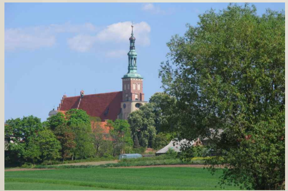
Benedictine monastery in Lubiąż.