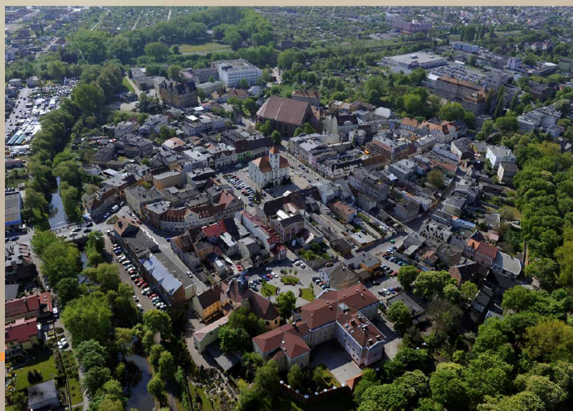
Old town in Kościan.