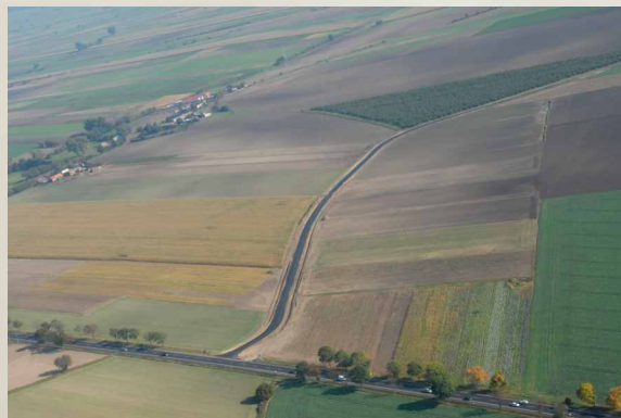
Access road connecting the Economic Activity Zone to the main road number 5.