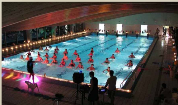
Swimming-pool in Kościan.