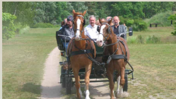
Special carriage riding.