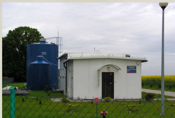
Water treatment plant in Widziszewo.