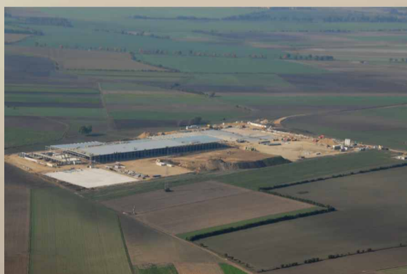
The Economic Activity Zone in Widziszewo.