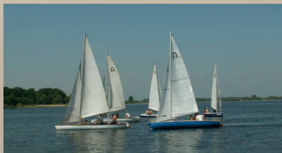
Sailing on Wonieskie Lake.