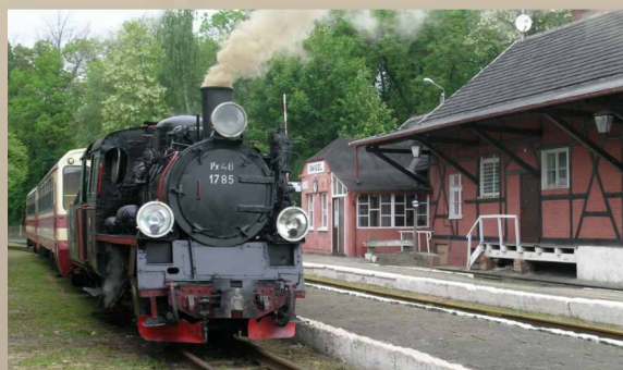
Touristic narrow-gauge railway in Śmigiel.