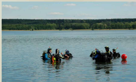
Diving in Dominickie Lake.