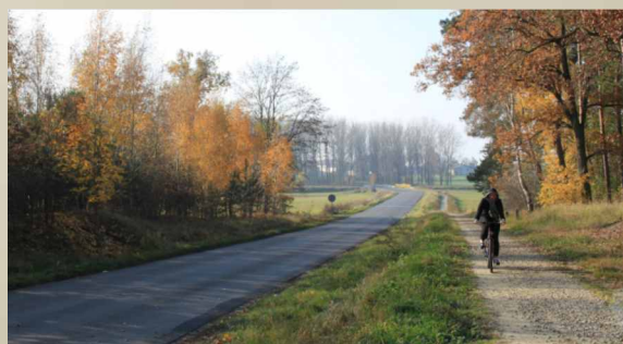
Bicycle lane near Gryżyna.