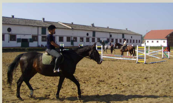
Riding school in Horse Farm in Racot.