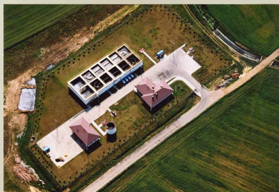
Sewage treatment plant in Koszanowo near Śmigiel.