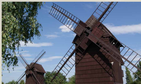
Wooden windmill in Śmigiel.