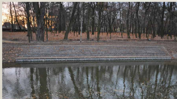
Canoe haven in Kościan.