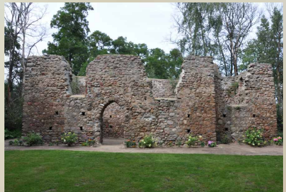
Ruins of st. Martin church near Gryżyna.